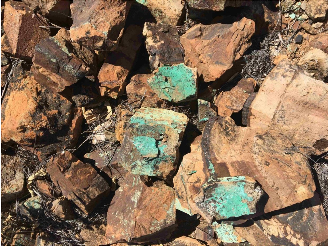
Plate 1. Rocks showing weathered sulphide veining and copper staining.