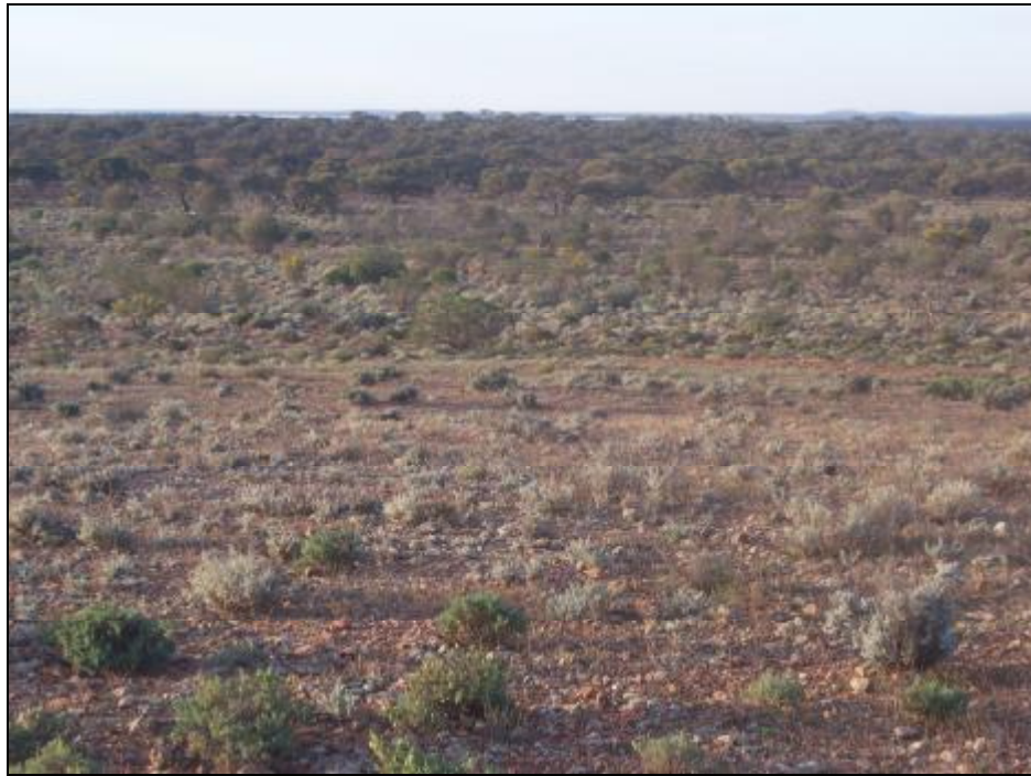
EL 3721 – Looking west toward Evelyn Dam Prospect