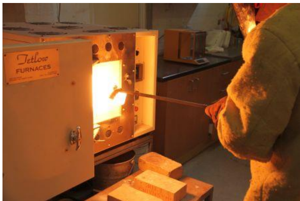
Figure 2: Removing crucibles from the furnace

The CSIRO test work was completed during the Quarter (refer to ASX announcements dated 04/10/16 and 17/11/16). The magnesite was roasted in an air heated muffle furnace at the temperature ranges stated above. The furnace was held at these temperatures for one and two hour periods. This test work showed that MDBM could be made at each of the different temperatures.