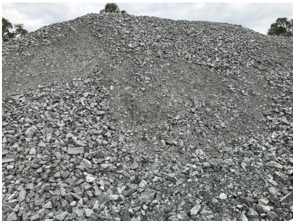
Figure 4: Magnesite stockpile (Adelaide)

Magnesite ore was mined at Leigh Creek and initially stockpiled in Adelaide in preparation for the trial. The magnesite ore was transported to Whyalla for crushing (6mm – 20mm) and then despatched to the Whyalla Steelworks for calcining.