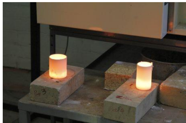
Figure 3: Heat 8, crucibles cooling