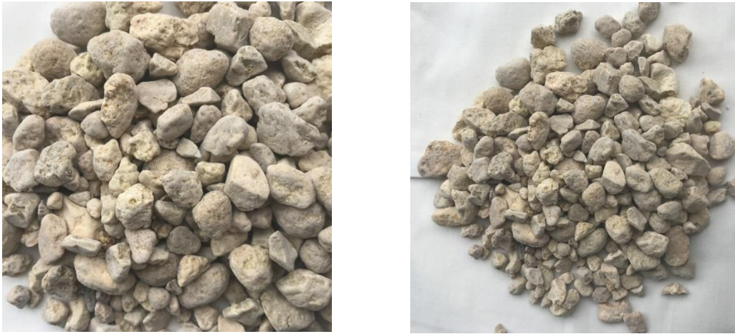
Figure 6: Photos of Archer deadburn magnesia product made during bulk trial

Archer completed the bulk trial during the period 28 – 30 November 2016 with visual inspection showing that MDBM was made during the calcining process.