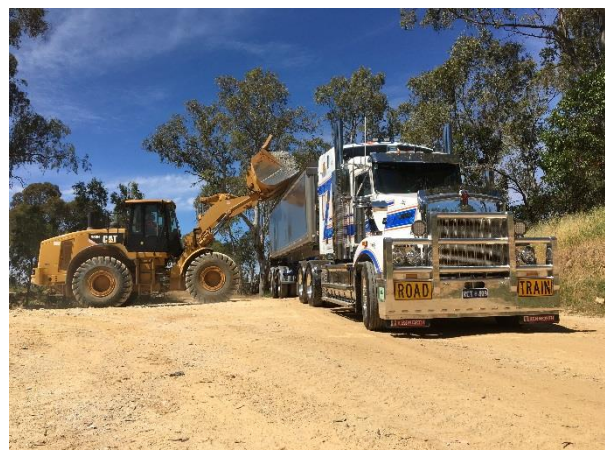
Figure 5: Loading of magnesite for transport