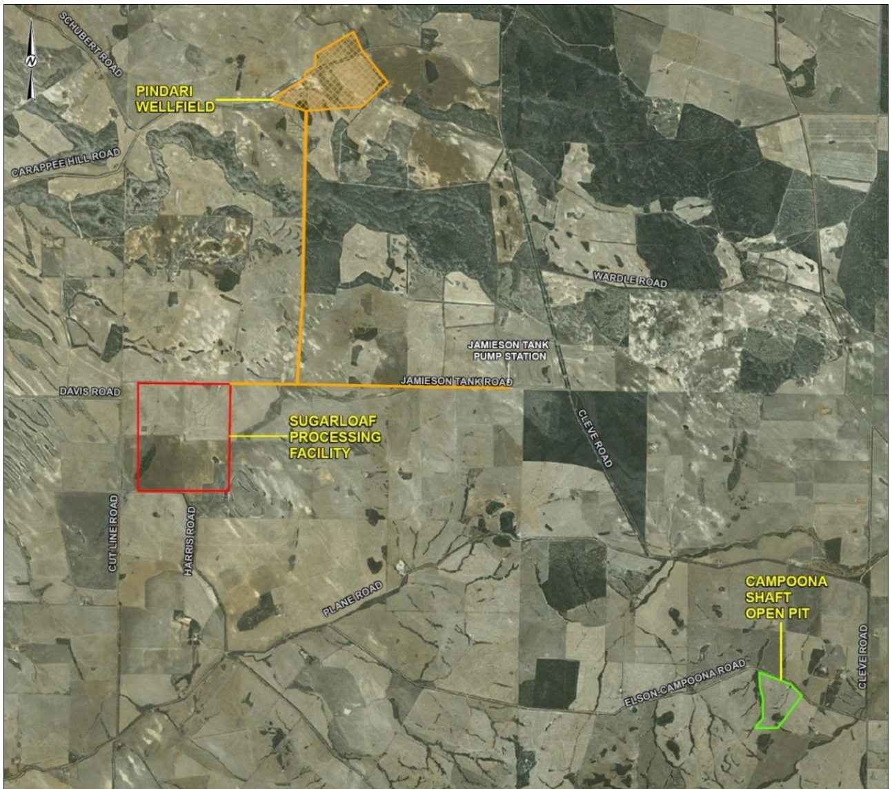
Figure 1: Location of Campoona MLA (green), Sugarloaf Graphite Processing Facility MPL (red) and Pindari Borefield and Pipeline MPL (orange)